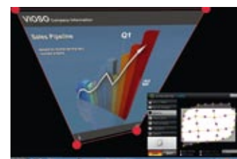
Example of your screen : warping