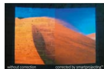
Example of a possible canvas.