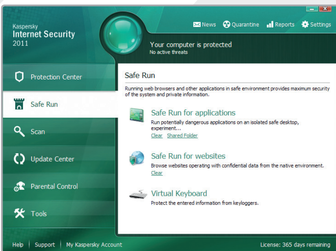
Kaspersky Internet Security 2011. Main window